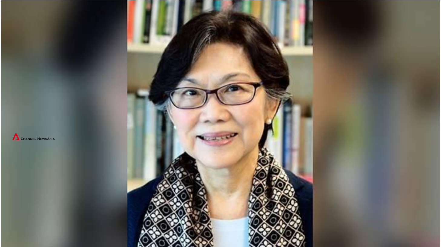
File photo of Chan Heng Chee.

02 Nov 2017 10:10AM (Updated: 02 Nov 2017 10:11AM)