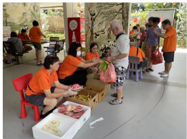
Figure 5: Residents collecting rescued food at Sunflower RC Community Fridge