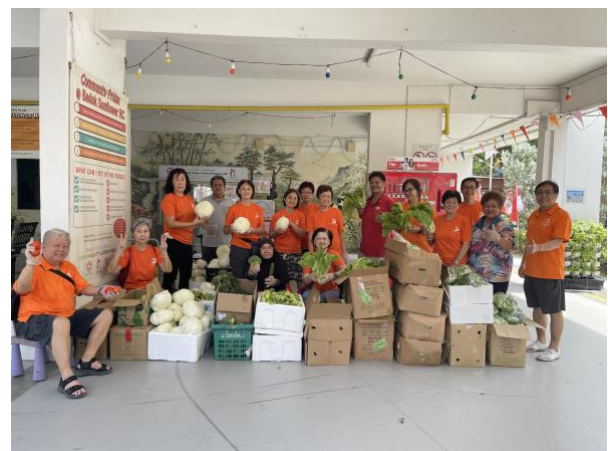
Figure 2: Active ageing centre volunteers helped sort, clean and organise rescued fruits and vegetables at Sunflower RC