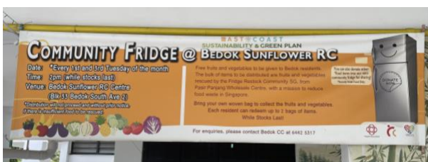
Figure 4: Collection schedule and instructions

Residents can bring their own woven bag and collect up to 2 bags of rescued fruit and vegetables every 1 st and 3 rd Tuesday of the month at 2pm from the community fridge (Figure 4 and Figure 5).