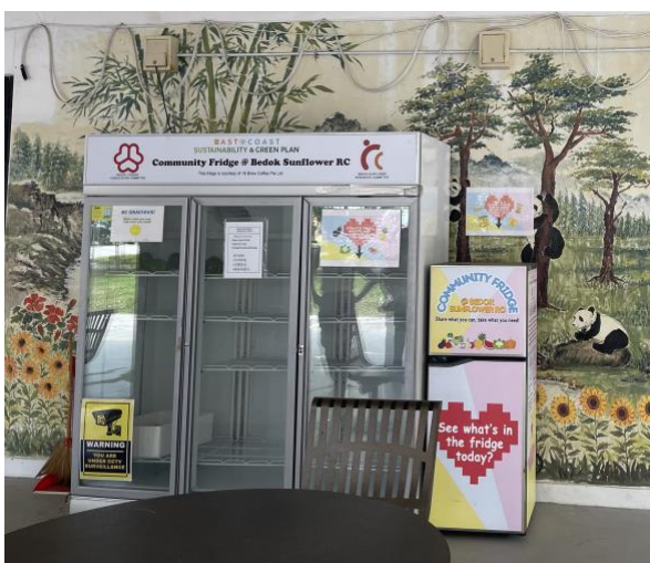
Figure 1: Community fridge at Bedok Sunflower RC

The community fridge at Bedok Sunflower RC (Figure 1) is one of the community fridges established by the Fridge Restock Community SG, a non-profit organisation that rescues edible unsold fruit and vegetables from Pasir Panjang Wholesale Centre and redistributes to 14 community fridges and more than 40 distribution points across Singapore to reduce food waste and help residents who are in need (Fridge Restock Community SG, n.d.).